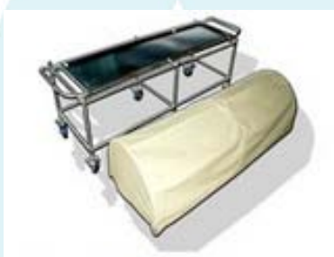
Transport trolley with cover